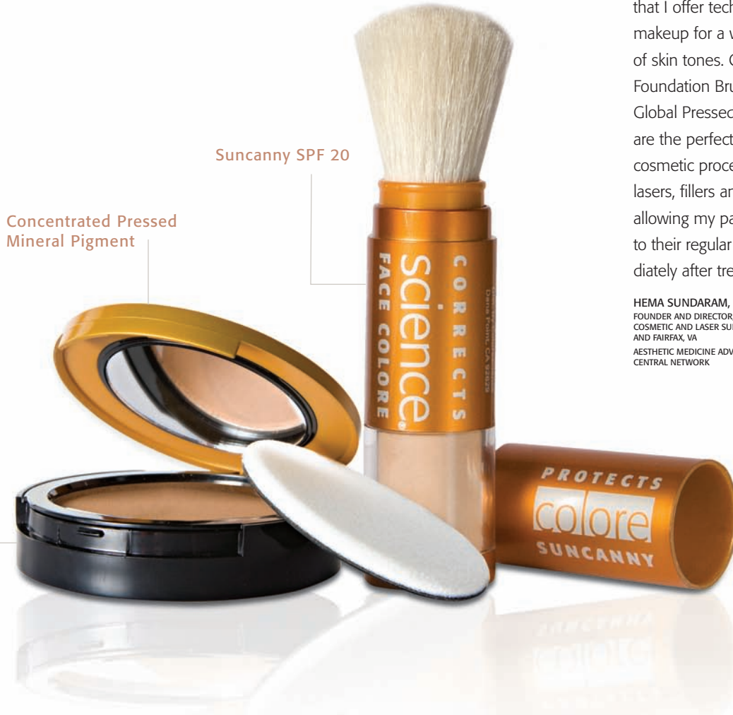
Concentrated Pressed Mineral Pigment

Colorescience brings you a sophisticated palette of highly pigmented, light reflective COLORES that give your skin a flawless, youthful look.