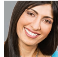
Suncanny SPF 20