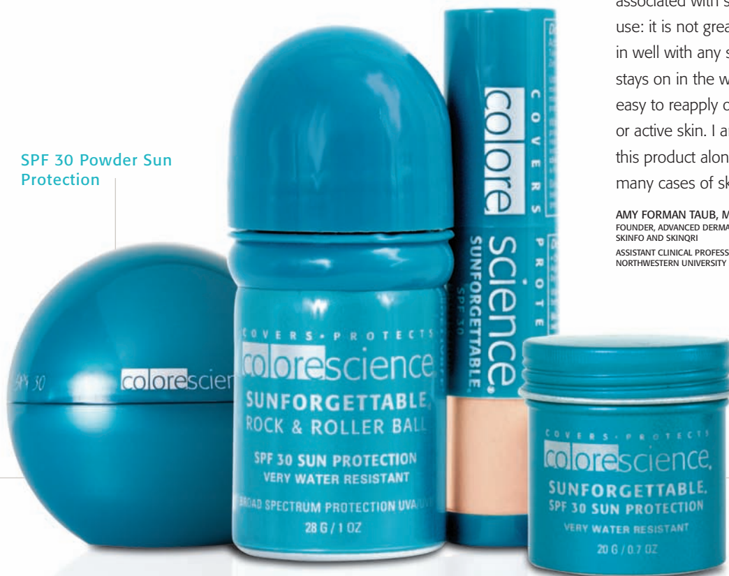
SPF 30 Powder Sun Protection

Colorescience mineral powder sunscreen will PROTECT your skin instantly, easily, and effectively. Easy to apply and reapply makes sunscreen compliance fun.